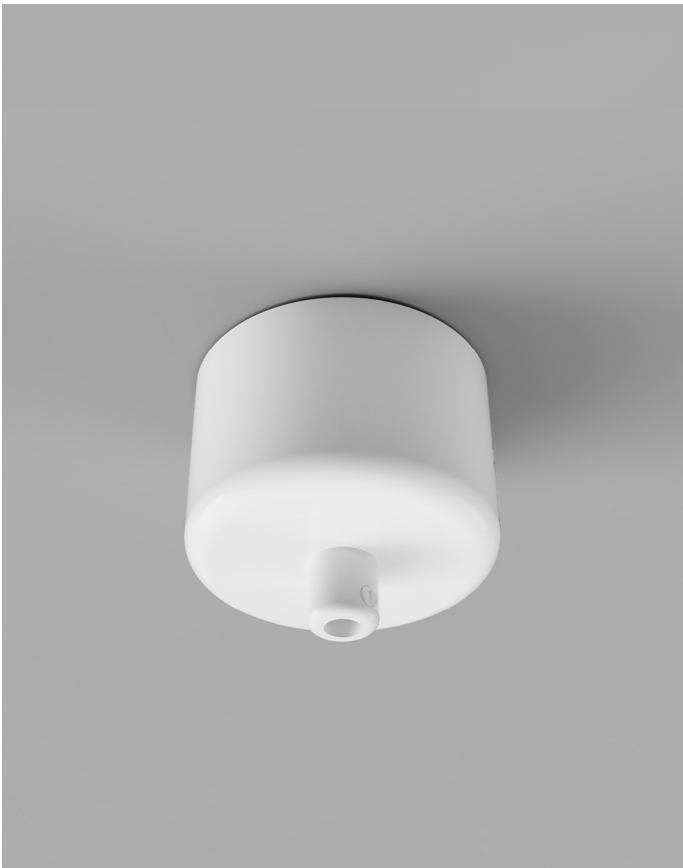
Single Canopy LR.A02.SCC.WH