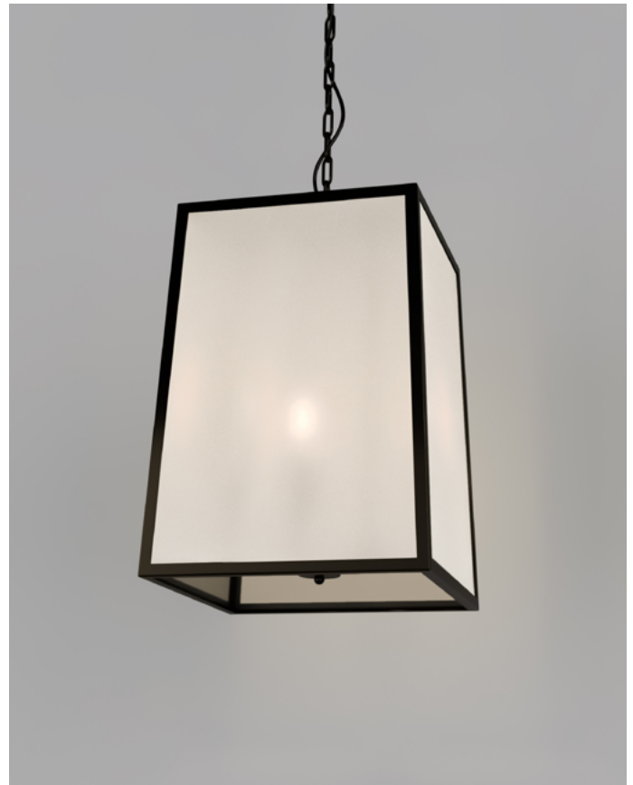
4 Light | Frosted i03.73.003.FR