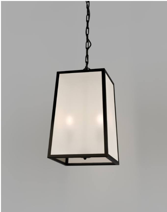
2 Light | Frosted i03.73.002.FR