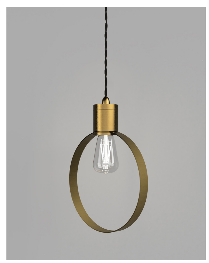
Ring LR.i02.25.OB + LR.A35.RNG.OB