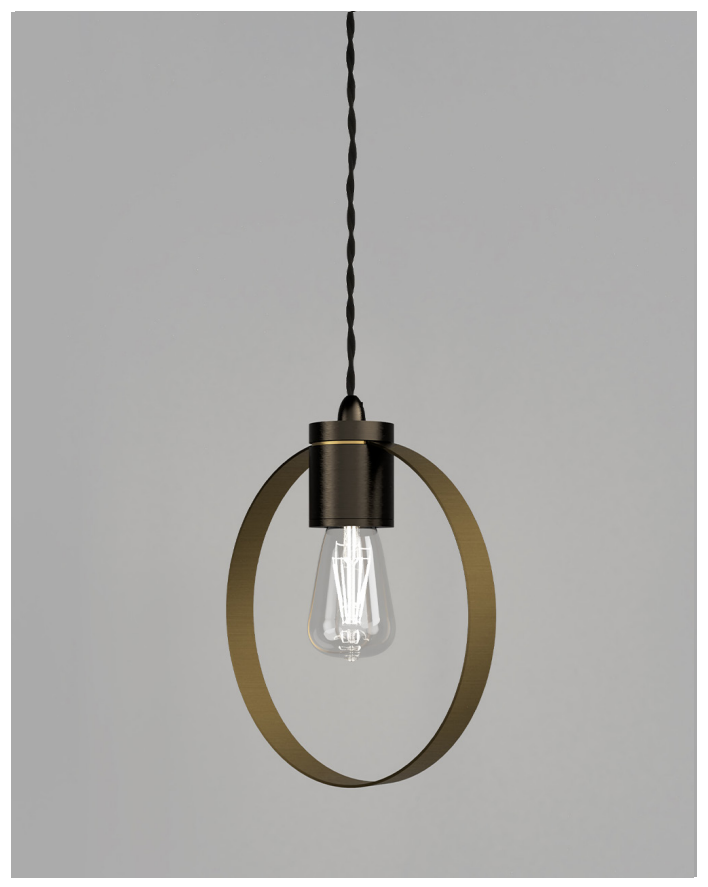
Ring LR.i02.25.IRN + LR.A35.RNG.OB