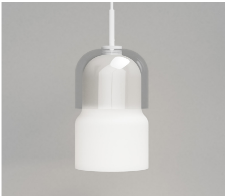
Clear / White LR.i02.65.T.CL + LR.i02.65.B.WH + LR.i02.65.WH.SSP