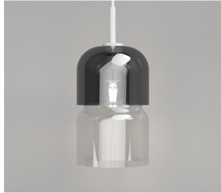
Smoke / Clear LR.i02.65.T.SM + LR.i02.65.B.CL + LR.i02.65.WH.SSP