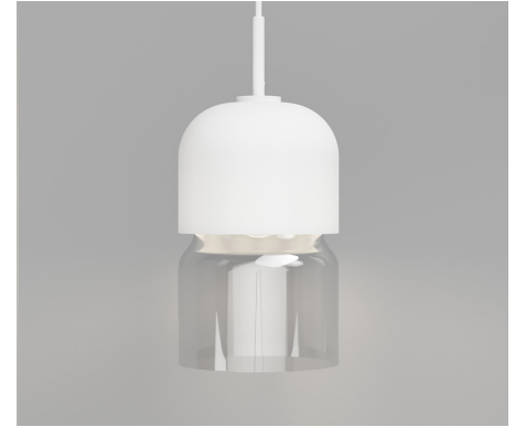
White / Clear LR.i02.65.T.WH + LR.i02.65.B.CL + LR.i02.65.WH.SSP