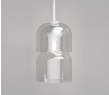
Clear / Clear LR.i02.65.T.CL + LR.i02.65.B.CL + LR.i02.65.WH.SSP