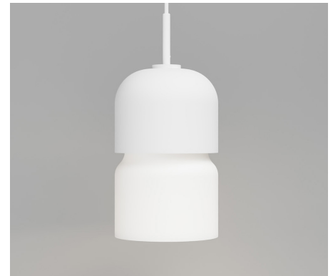
White / White LR.i02.65.T.WH + LR.i02.65.B.WH + LR.i02.65.WH.SSP