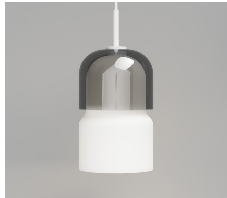
Smoke / White LR.i02.65.T.SM + LR.i02.65.B.WH + LR.i02.65.WH.SSP