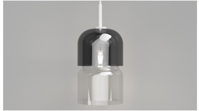
Smoke / Clear LR.i02.65.T.SM + LR.i02.65.B.CL + LR.i02.65.WH.SSP