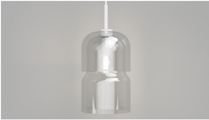
Clear / Clear LR.i02.65.T.CL + LR.i02.65.B.CL + LR.i02.65.WH.SSP